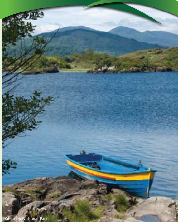
Killarney National Park