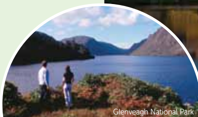
Glenveagh National Park