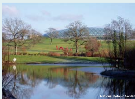
National Botanic Garden