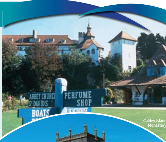
Caldey Island Monastery