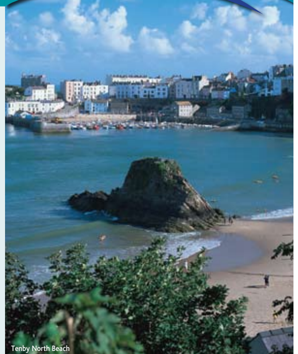
Tenby North Beach

Costs shown are per person, for half board sharing a double or twin room Giltar - No single room supplement. Sea view supplement £12.50 per person Park - Single room supplement £30